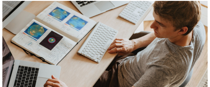
HR Compliance Library

Have questions? Let's connect. Email selecthealth@trustmineral.com , or visit trustmineral.com for more information.